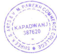
Principal Shah K.S. Arts & V.M. Parekh Commerce College, Kapadwanj.